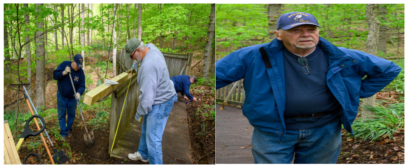
Island X-3 Seabees revamp bridge over stream, allowing campers with special needs to traverse stream

The Bees are working hard on a cold and chilly Saturday at YMCA Camp Kon-O-Kwee Spencer.